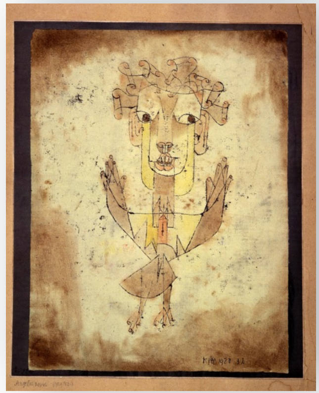
Paul Klee, Angelus Novus (1920), monoprint, oil transfer, Israel Museum, Jerusalem.

Open public lecture "Environmental Change, Re-thinking Religion" will be held at Doug Adams Gallery, on Sunday, October 23rd, 2016, from 2:30 to 4:30pm, located at 2465 Le Conte Avenue, Berkeley, CA 94709